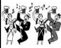
Ohm Pah Band revellers