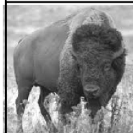
North American Buffalo