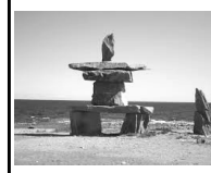
Inukshuk, Hudson Bay