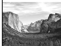
Yosemite National Park