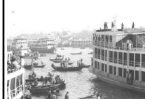
Bay of Bengal