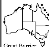
Great Barrier Reef