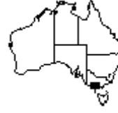
Great Ocean Road