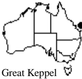
Great Keppel Island